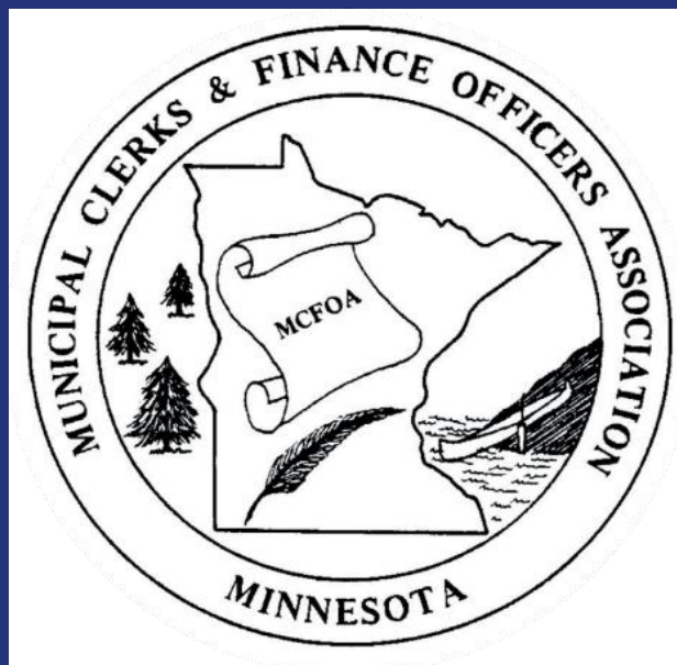
Exhibit Show March 21, 2024